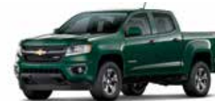
G7J - RAINFOREST GREEN METALLIC 6,7