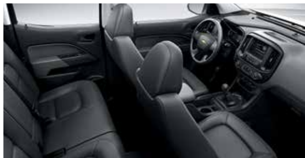
Jet Black/Dark Ash Vinyl 1