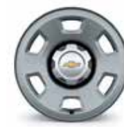
16" Ultra Silver Metallic-Painted Steel (Standard on Base and WT)