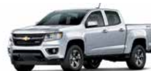
GAN - SILVER ICE METALLIC