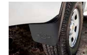
Custom-Moulded Black Splash Guards with Logo