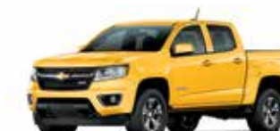
GCO - RALLY YELLOW 6,8