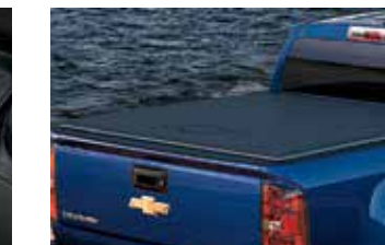
Tonneau Cover: Soft, Foldable with Logo