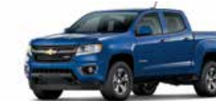
G7Z - LASER BLUE 6,8