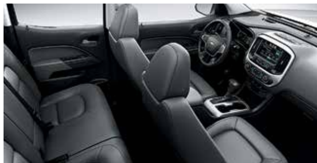
Jet Black/Dark Ash Leather Appointments 4