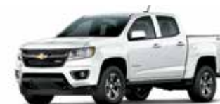
GAZ - SUMMIT WHITE