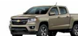
GWX - BROWNSTONE METALLIC 6