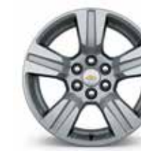
17" Dark Argent Metallic-Painted Cast-Aluminum (Standard on Z71)