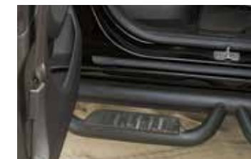
Assist Steps: 3-in. Black Step Bars

PERSONALIZE YOUR COLORADO AT GMACCESSORIES.CA