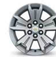
17" Blade Silver Metallic-Painted Cast-Aluminum (Standard on LT)