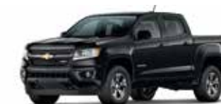
G8A - BLACK