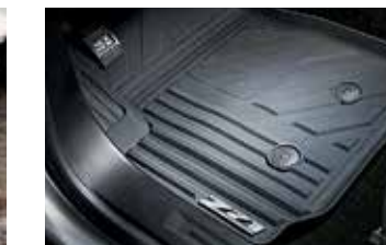
Premium All-Weather Floor Mats with Logo