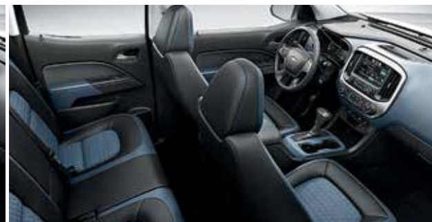
Jet Black/Dark Galvanized Cloth/Leatherette 5