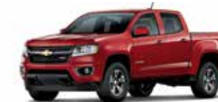
G7P - RED ROCK METALLIC 6