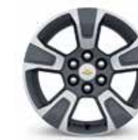
18" Dark Argent Metallic-Painted Cast-Aluminum (Available on LT)