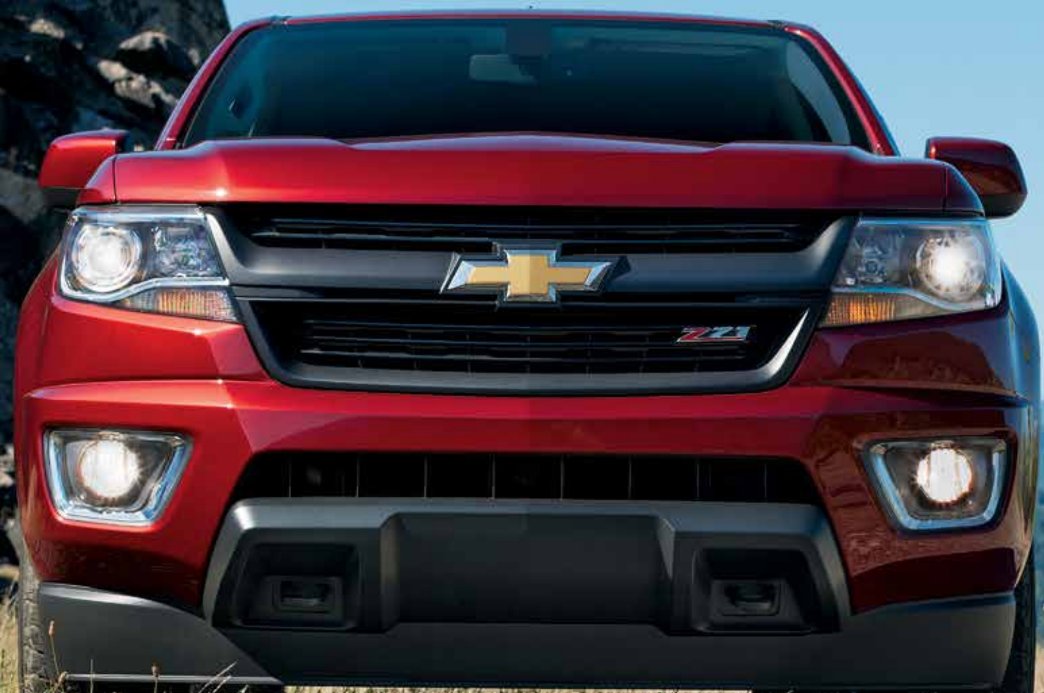
Colorado Crew Cab Z71 4x4 in Red Rock Metallic.