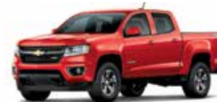
G7C - RED HOT 6