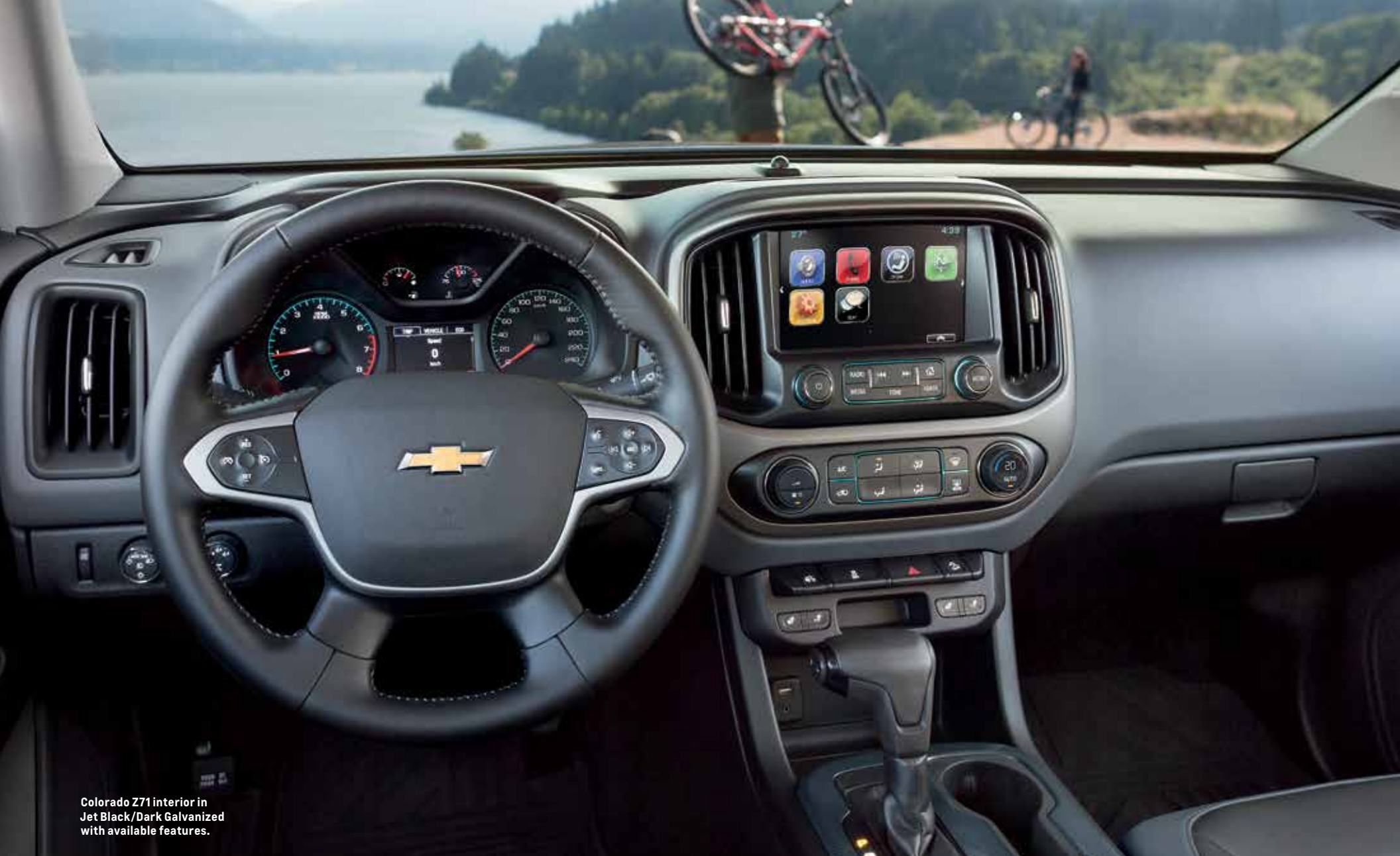
Colorado Z71 interior in Jet Black/Dark Galvanized with available features.