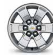
16" Ultra Silver Metallic-Painted Cast-Aluminum (Available on WT)