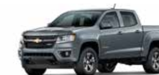
GBV - CYBER GREY METALLIC 6