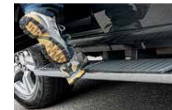
Assist Steps: 5-in. Chrome Rectangular